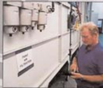
Compressed Air Analysis