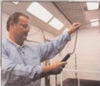
Air Flow Charting and Booth Balancing