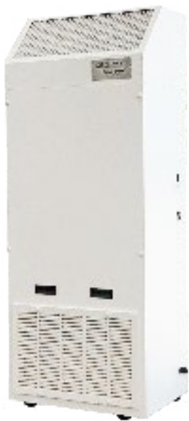
IsoClean 800 air cleaning recirculation setup

Portable, self-contained High Efficiency Particulate Air (HEPA) filtration system with optional UV-C light.